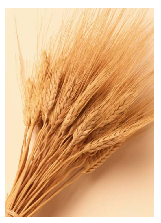
Your Secret Weapon To A Healthy Eating Lifestyle <a href="http://recipes.healthymenumailer.com">http://recipes.healthymenumailer.com</a> Copyright 2005 All Rights Reserved – Forward Me To A Friend!

375 Calories Total Fat 2 grams Saturated Fat 0 grams 0 milligrams Cholesterol 106 milligrams Sodium Total Carbohydrate 90 grams Dietary Fiber 4 grams 43 grams Sugars Protein 3 grams