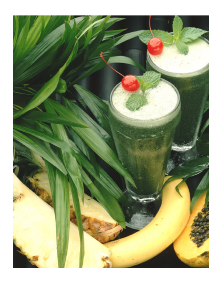
Brought To You By